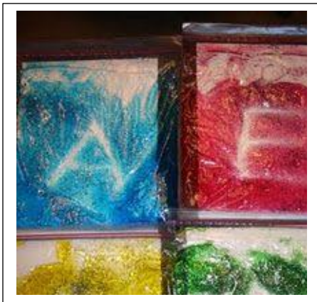
Gel Bags (Baggie, hair gel, food coloring)