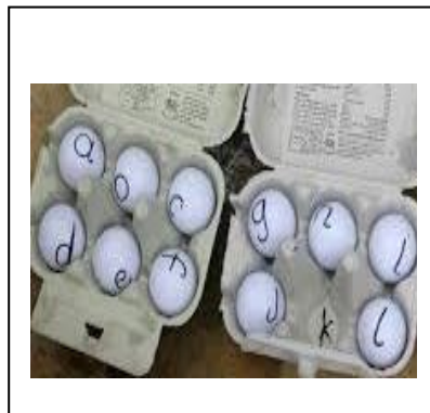
Match Capital and Lower Case Letters