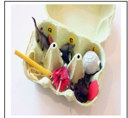
Match Letters and Beginning Sound