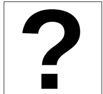
Make Up A New Game!